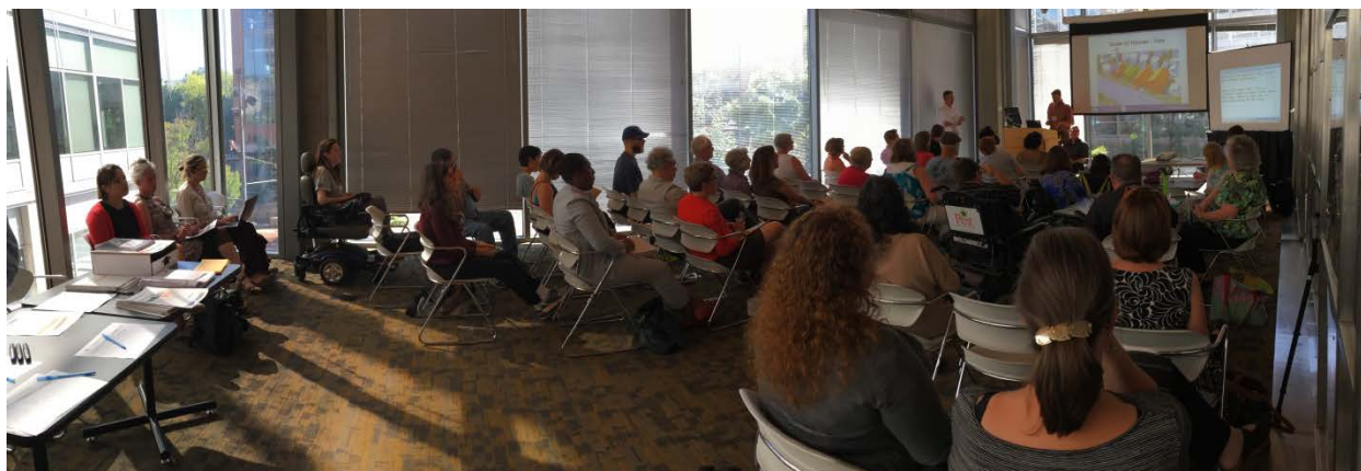
Image 2 - Open house focused on issues of accessibility at Portland State University on July 20, 2016

On July 20, 2016, an open house was held to garner input on the proposal from older adults, people with disabilities, and advocates for accessible housing (see image 2 below). The event had approximately 35 community members who weighed in on the proposal. Important input from the event included: the clear desire for people with disabilities to be engaged in the development of accessibility standards, the feeling that affordability and accessibility (combined) were issues faced by people looking for accessible housing, that accessibility and affordability should be required for bonus units in the proposal, and both support for and opposition to the proposal from the City. Regarding the latter item, it should be noted that the open house was similar to other open houses in that some attendees, including older adults, offered resistance to the proposal as it was feared that the City’s proposal would lead to undesired changes in their neighborhoods. On the other side, support was offered from individuals who were interested in opportunities to age in their communities when the current housing stock would not support it.