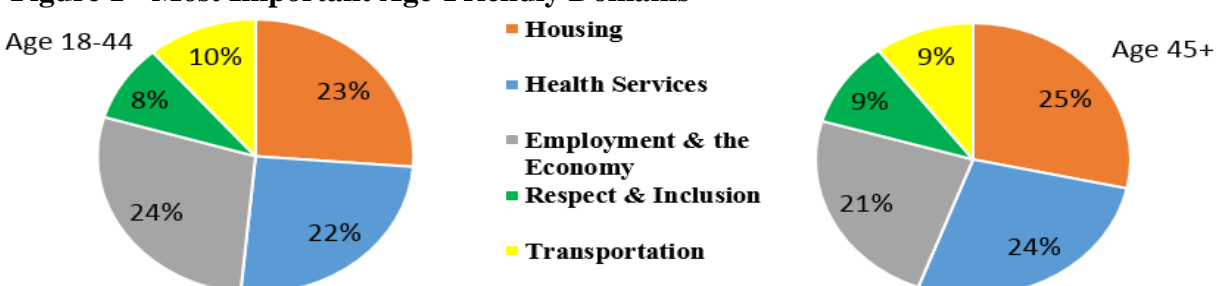
Figure 1 - Most Important Age-Friendly Domains

Various domains are thought to contribute to a community's age friendliness. The WHO defines eight, and other communities expand or contract these. The ten domains of focus in Portland, Oregon's, effort – one of the first and longest-running age-friendly initiatives in the world – formed the basis for the questions concerning age friendliness in this study. Asked to rank the "most important age-friendly areas," respondents prioritized five domains (N=1,295): housing, health services, employment and the economy, transportation, and respect and inclusion (see Figure 1). The age groups' (18-44 and 45+) rankings were remarkably similar.